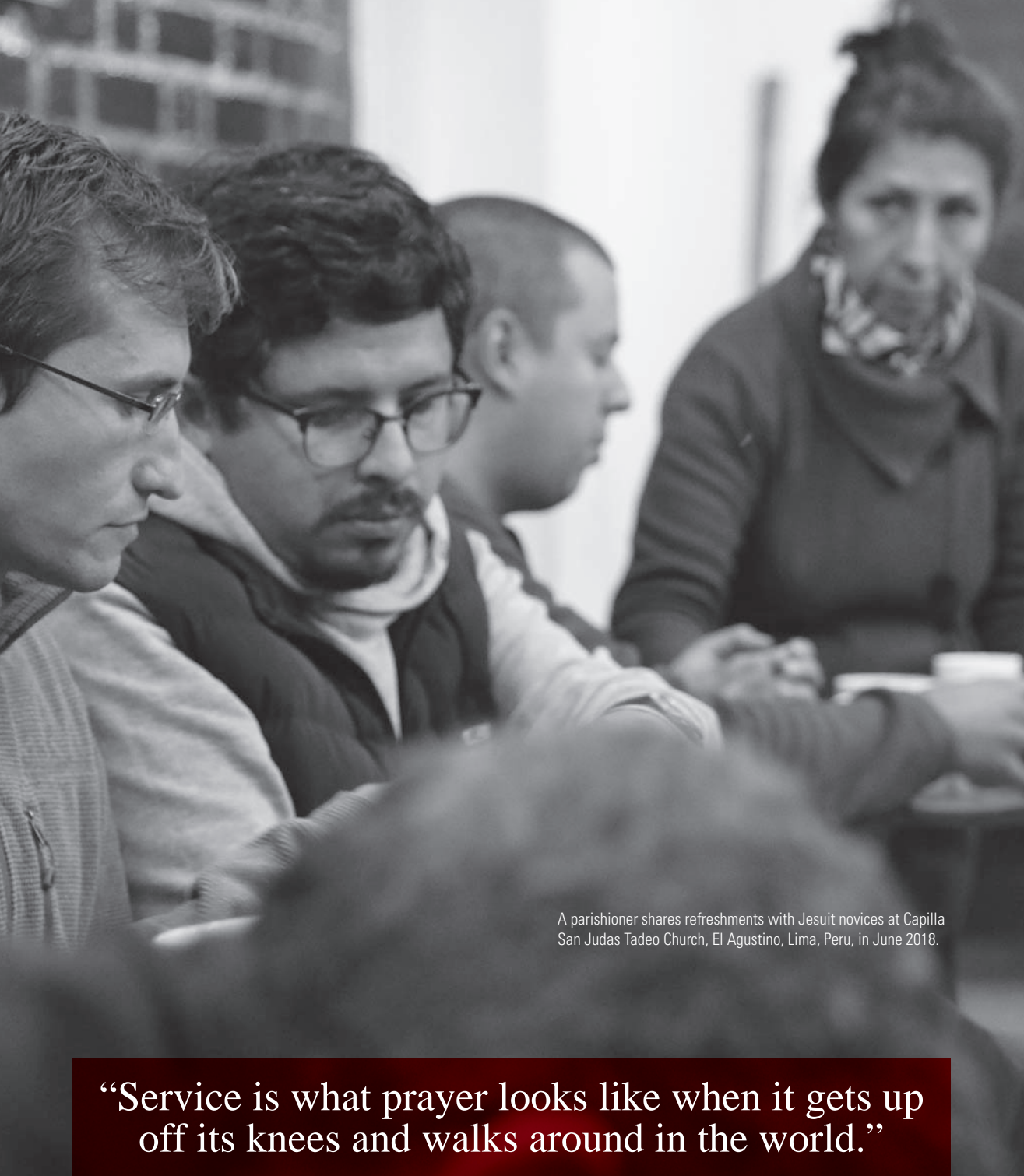
A parishioner shares refreshments with Jesuit novices at Capilla San Judas Tadeo Church, El Agustino, Lima, Peru, in June 2018.

“Service is what prayer looks like when it gets up off its knees and walks around in the world.”