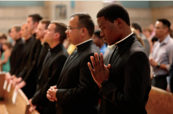
Seven Midwest Jesuits pronounced first vows at the first vows Mass on August 11 in Saint Paul, Minn.

The Jesuit formation process is famously rigorous. We spend a decade or more educating and forming young Jesuits so that they are thoroughly ready to serve people for the Greater Glory of God. I am so fortunate to serve as the Midwest Jesuits' provincial assistant for formation because I have the opportunity to accompany these Jesuits as they take each step in their formation. I am continuously inspired by their zeal, knowledge, and love for the People of God and the Church.