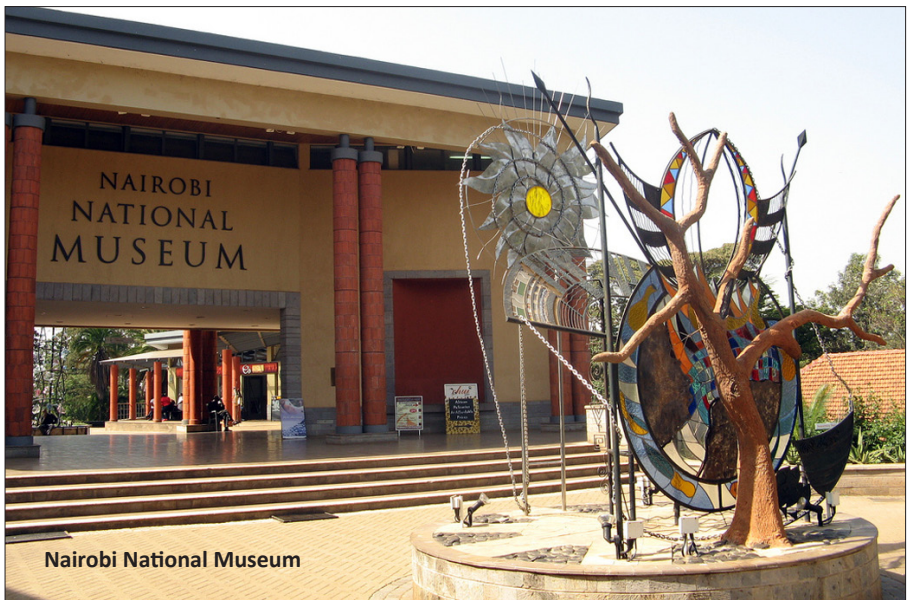
Nairobi National Museum