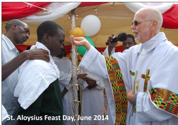
St. Aloysius Feast Day, June 2014

Celebrate St. Al's Feast Day with students and staff on Sunday, June 19, 2016. Students at St. Al's have lost one or both of their parents to AIDS. This Jesuit school gives these students hope for a bright future by providing a solid high school education and graduate program as well. Through the generosity of numerous benefactors, a new school