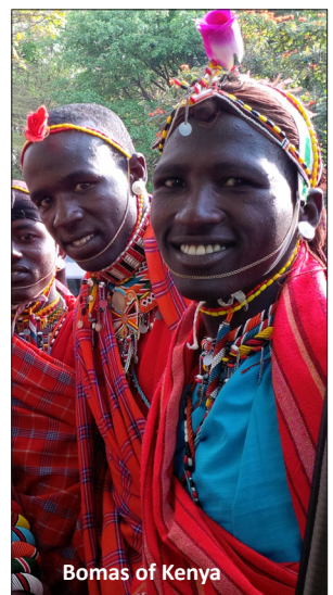
Bomas of Kenya