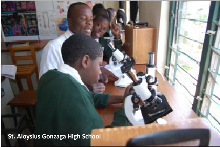
St. Aloysius Gonzaga High School