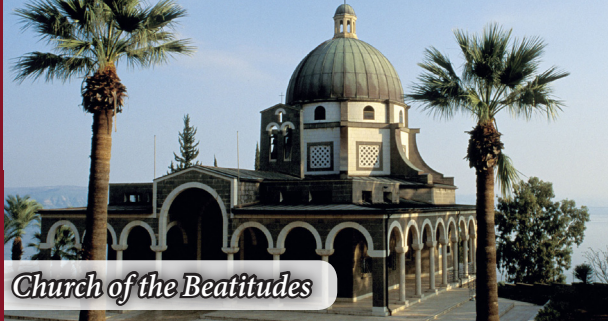
Church of the Beatitudes