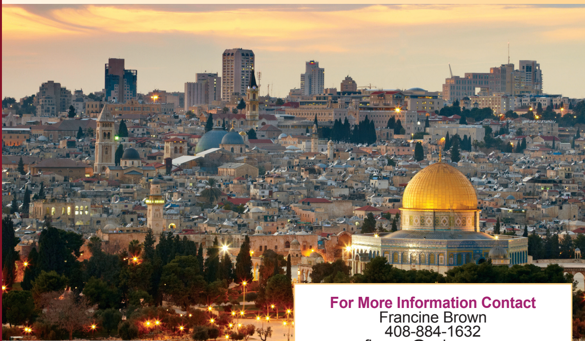
Jerusalem, The Holy City