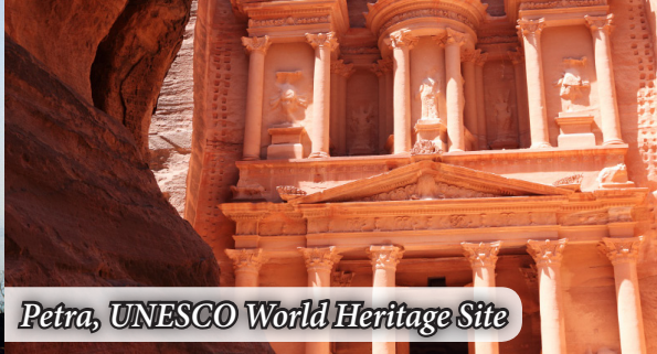
Petra, UNESCO World Heritage Site