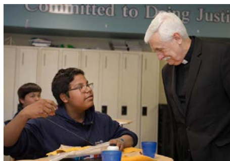
Fr. Arturo Sosa, SJ, visits with a student at Mother Teresa Middle School in Regina, Saskatchewan.

Father Arturo Sosa, SJ, Superior General of the Society of Jesus, made his first trip to the Jesuit Conference of Canada and the United States in late May when he visited Canada for 12 days to participate in the conference's spring meetings.