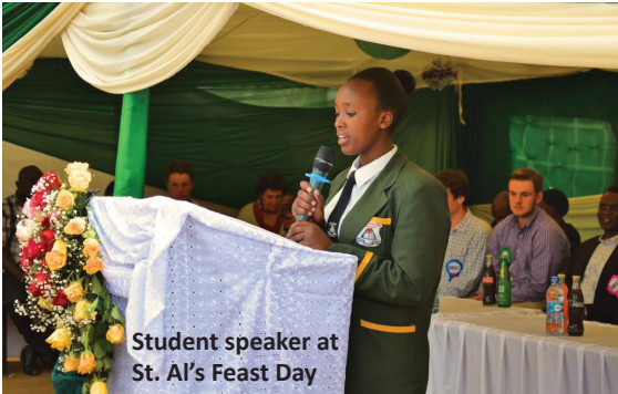
Student speaker at St. Al's Feast Day

Afternoon – Visit Chapel of Hekima College Jesuit School of Theology – African Liturgical Art, Karen Blixen Museum, Kazuri Beads