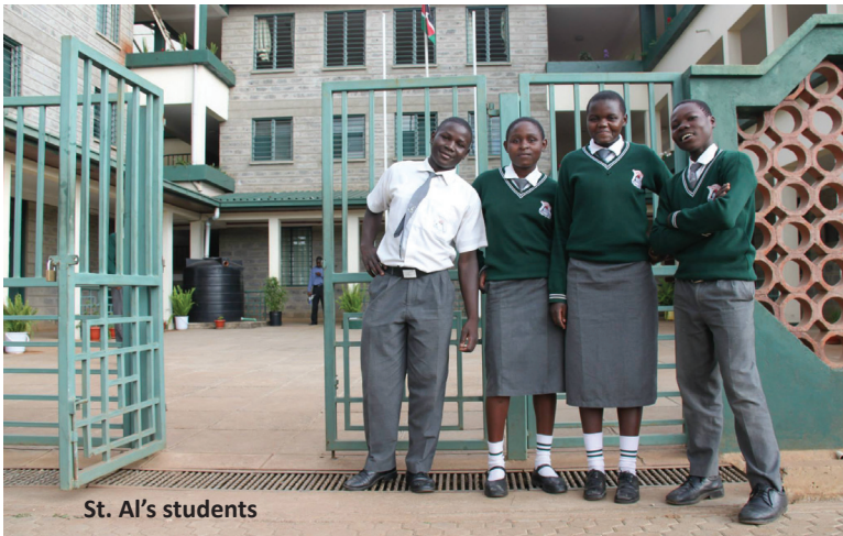
St. Al's students