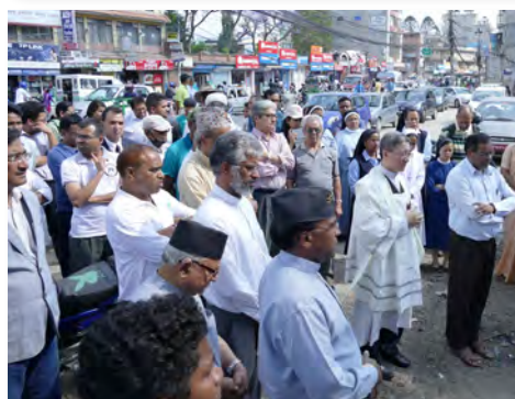
Jesuits lead a group in prayer at a ceremony to inaugurate the Nepal Jesuit Social Institute.