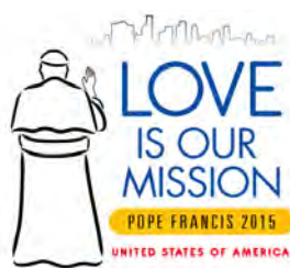
Official Papal Visit 2015 Logo

Cristo Rey Jesuit High School Milwaukee is part of a nationwide network of 30 Catholic, college preparatory high schools for low-income students. Its unique and innovative educational model empowers students to pursue higher education, arms them with the tools they need to thrive, and provides invaluable professional experience through its Corporate Work Study Program. Cristo Rey Milwaukee will open its doors in August, welcoming the Class of 2019. To learn more about the school or how you can sponsor the St. Louis Jesuits' concert, visit www.cristoreymilwaukee.org . ■