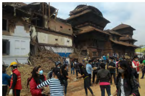
Student volunteers help relief efforts following Gorkha earthquake in Nepal.