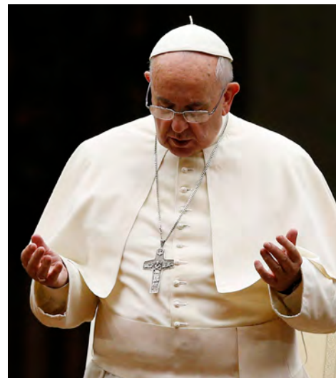
Pope Francis prays for the People of God and the Earth

The timing of this encyclical’s release is notable ahead of the United Nations Climate Change Conference in Paris later this year. The Paris meeting could be the last opportunity to negotiate agreements to keep warming below the 2 degrees Celsius (3.6 degrees Fahrenheit) benchmark agreed to at the Copenhagen Climate Summit in 2009. According to the Pontifical Academy of Sciences, sustainable development should be incentivized by all nations to rapidly transition toward greener technologies and low carbon energy. Predictably,