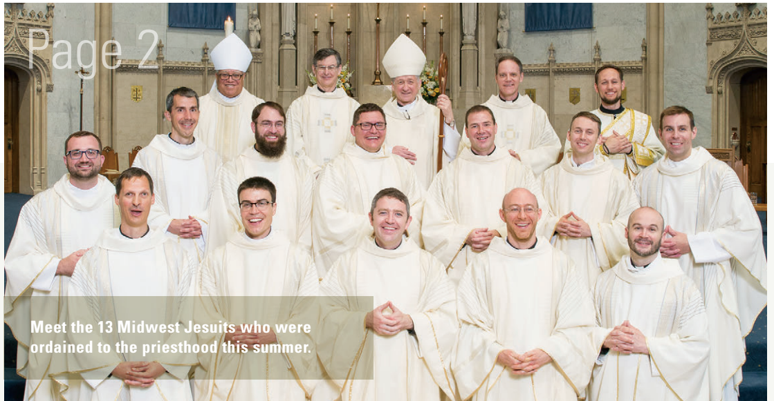
Meet the 13 Midwest Jesuits who were ordained to the priesthood this summer.

For additional content and more information, connect with us online: WWW.JESUITSMIDWEST.ORG