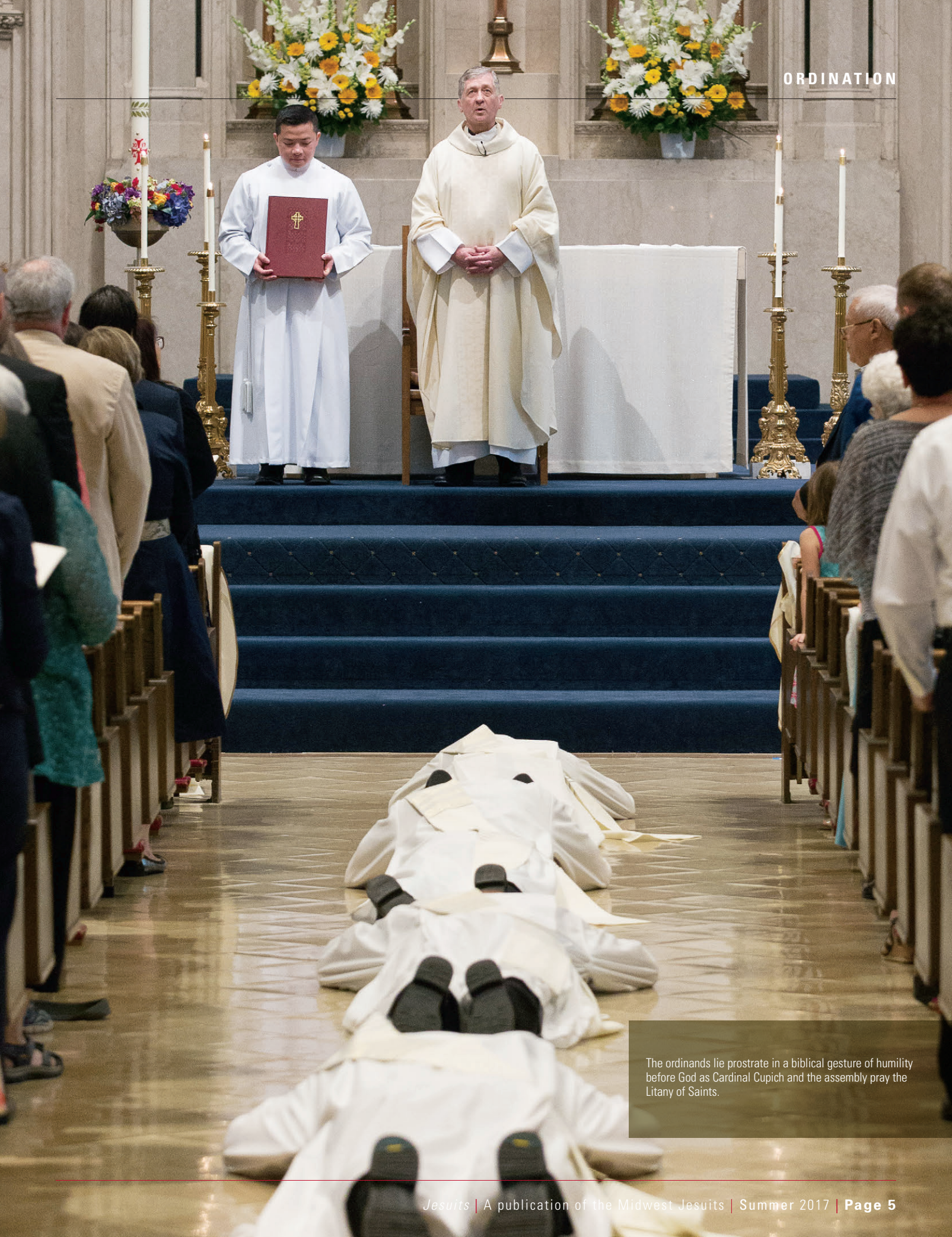
The ordinands lie prostrate in a biblical gesture of humility before God as Cardinal Cupich and the assembly pray the Litany of Saints.